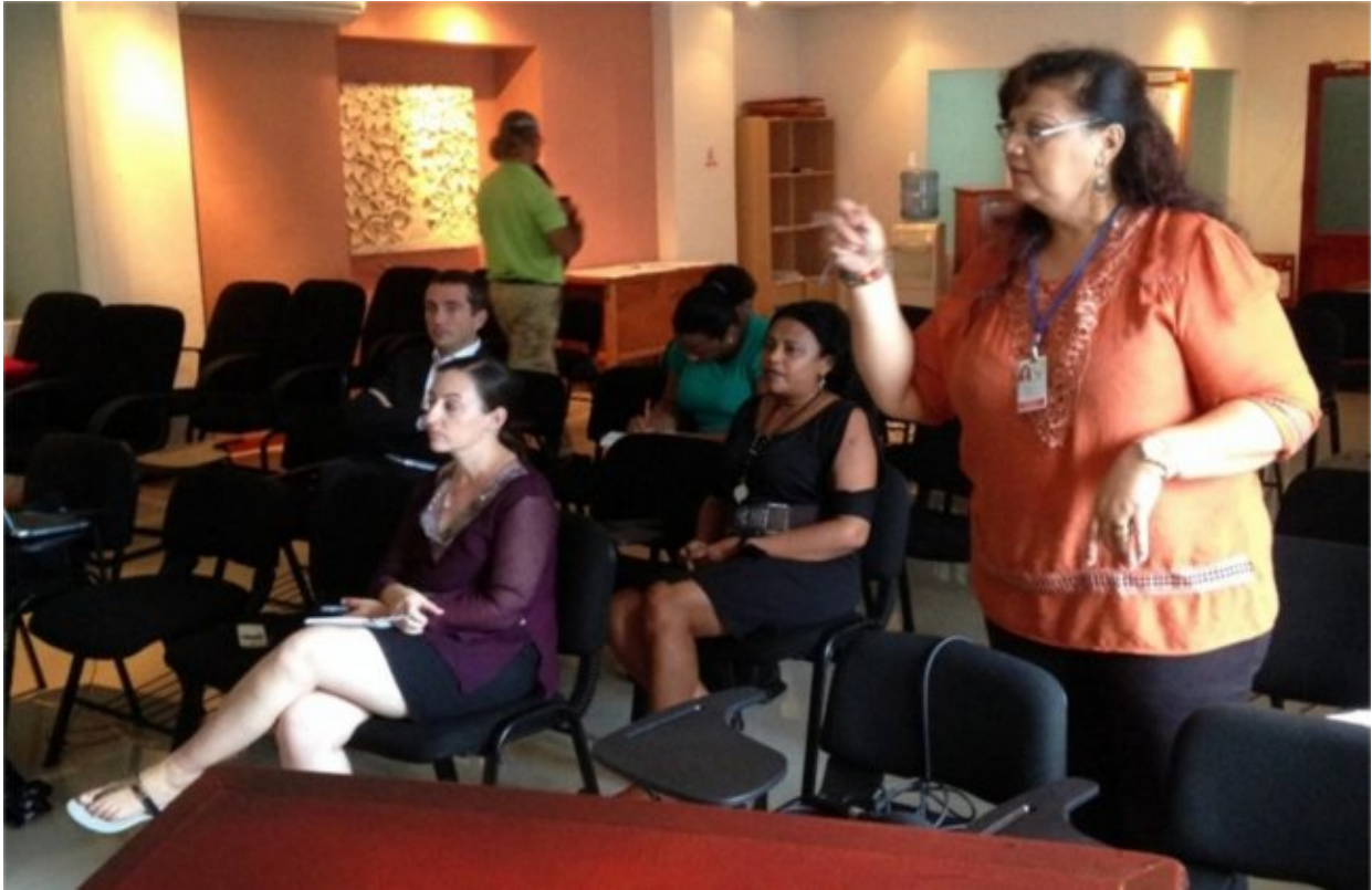
Meeting with local journalists/media houses