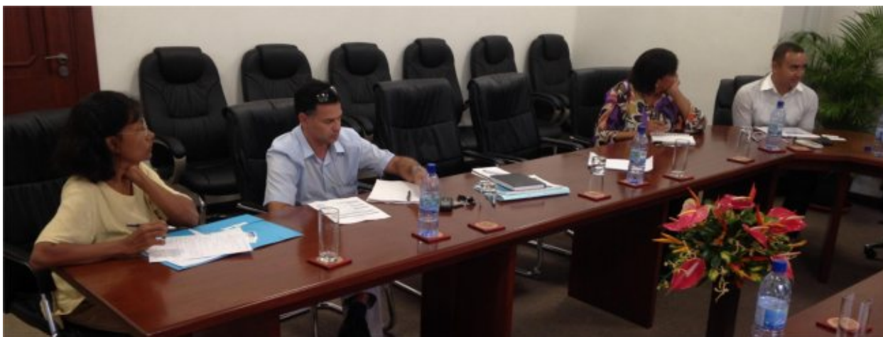
Some members of the Seychelles Multi-Stakeholder Group