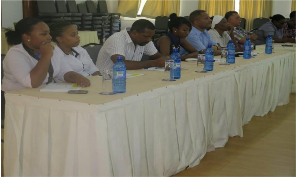
Seychelles EITI Stakeholders at the Workshop