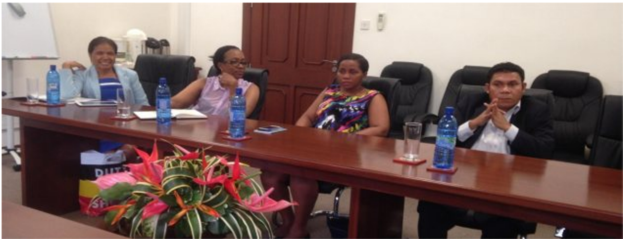
East Timor and Tanzania Delegations Meeting with Seychelles Minister for Finance, Trade and the Blue Economy