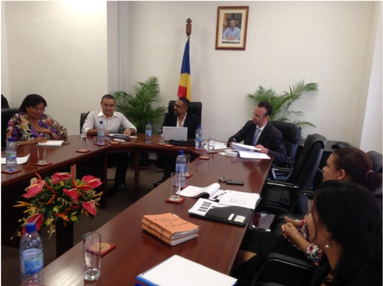
MSG and Independent Administrator at the end of the Mission meeting

Outstanding: At the end of the Mission, two of the reporting Government entities: Ministry of Finance, Trade and the Blue Economy (MFTBE) and the Seychelles Revenue Commission promised to get the Certification of the audited accounts from the Auditor General which was achieved in 2016.