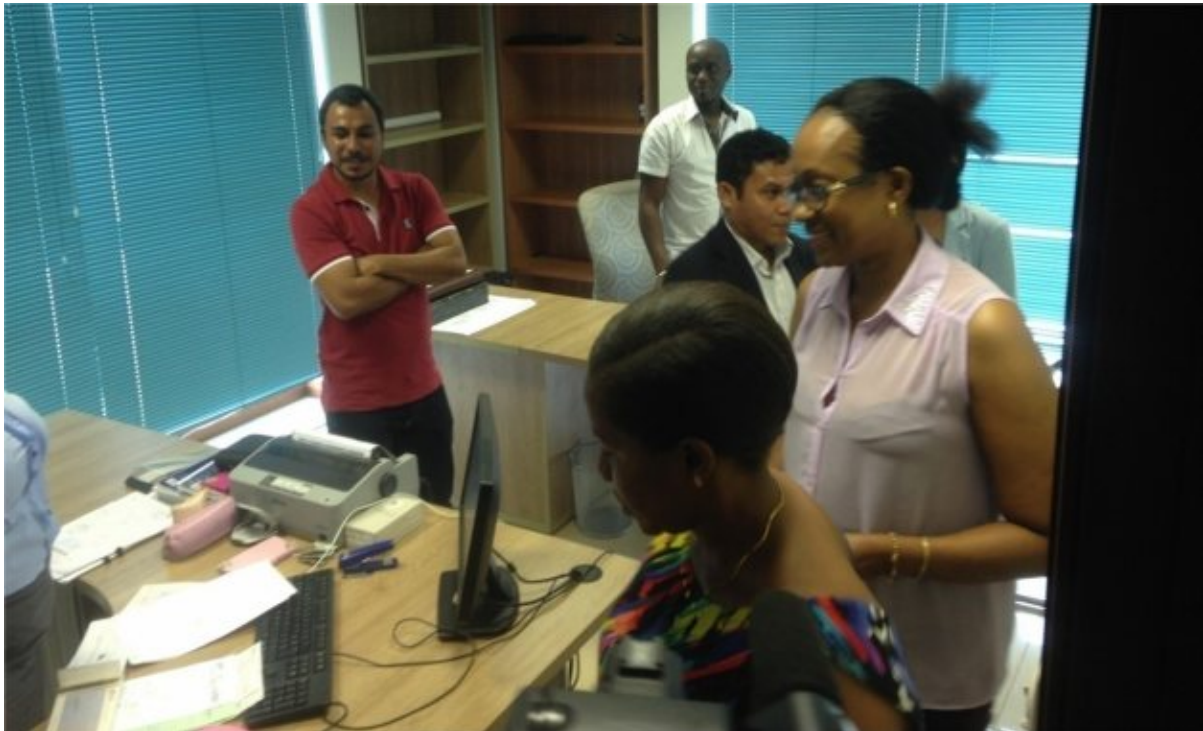
Tanzania and East Timor Delegations visit PetroSeychelles