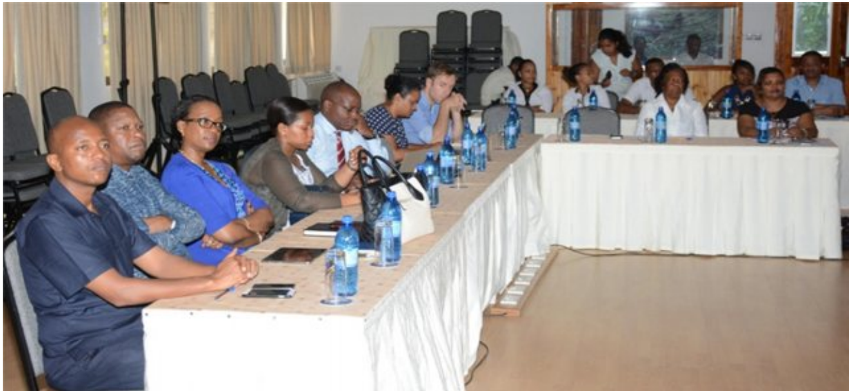
Tanzanian team and Seychelles Civil Society attending the workshop