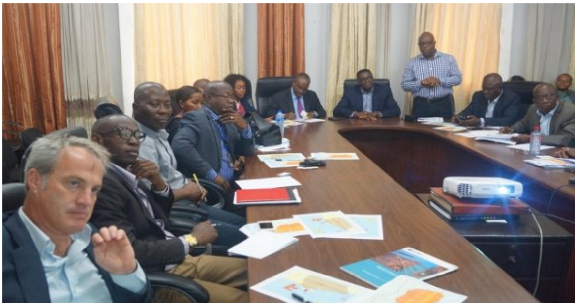
National Coordinators and Communication Officers in a session with the Ghanaian National Petroleum Company (GNPC) representatives