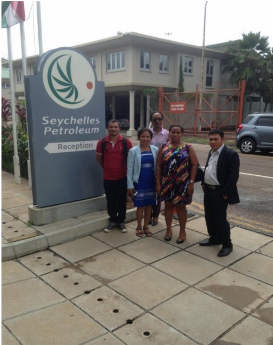
East Timor and Tanzania Delegations visiting the Seychelles Petroleum Corporation