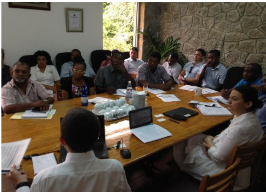
Training with Technical Staff and Senior officers from the Ministry of Environment, Energy and Climate Change and PetroSeychelles